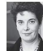
Heidi Miller Marsh, Inc.