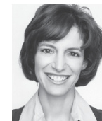
Cindi Leive Self Magazine