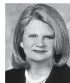
Geraldine Laybourne Oxygen Media