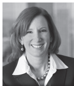
Cathy Engelbert Deloitte