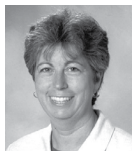
Beverly Wallace HCA, Inc.