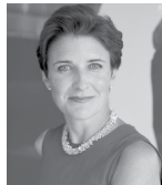
Jane Fraser Citi Private Bank