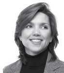
Beth Comstock GE