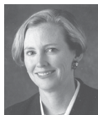
Ellen J. Kullman DuPont