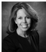
Maliz Beams ING U.S.